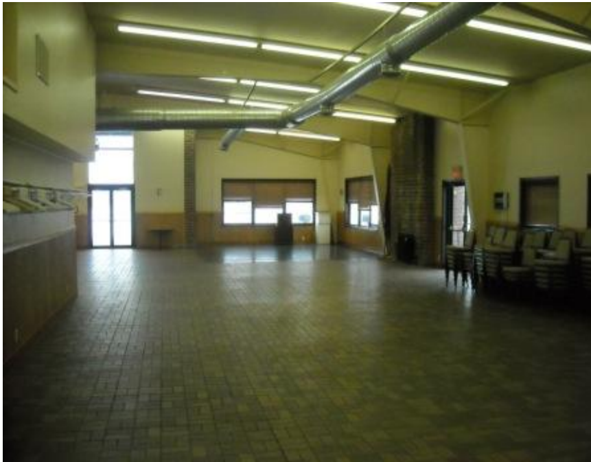
View from Parking Lot entry

Reservation availability of Pavilion and Picnic Shelters provided by calling Outdoor Recreation at 402-294-2108. Pavilion reservations accepted 1 year in advance for private and squadron functions and must be made in person with half of payment required at time of booking. The remaining balance is due 2 weeks prior to reservation. Reservations made and keys issued mid Apr-mid Oct at the Offutt Base Lake Castaways Boathouse, and mid Oct-mid Apr on base at Equipment Rental located on Butler Blvd behind STRATCOM.